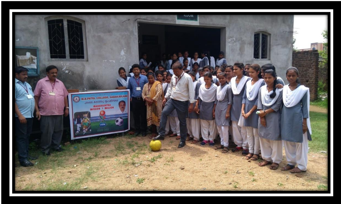
5. Inaguration of Sports Event Yuvarang 2017.