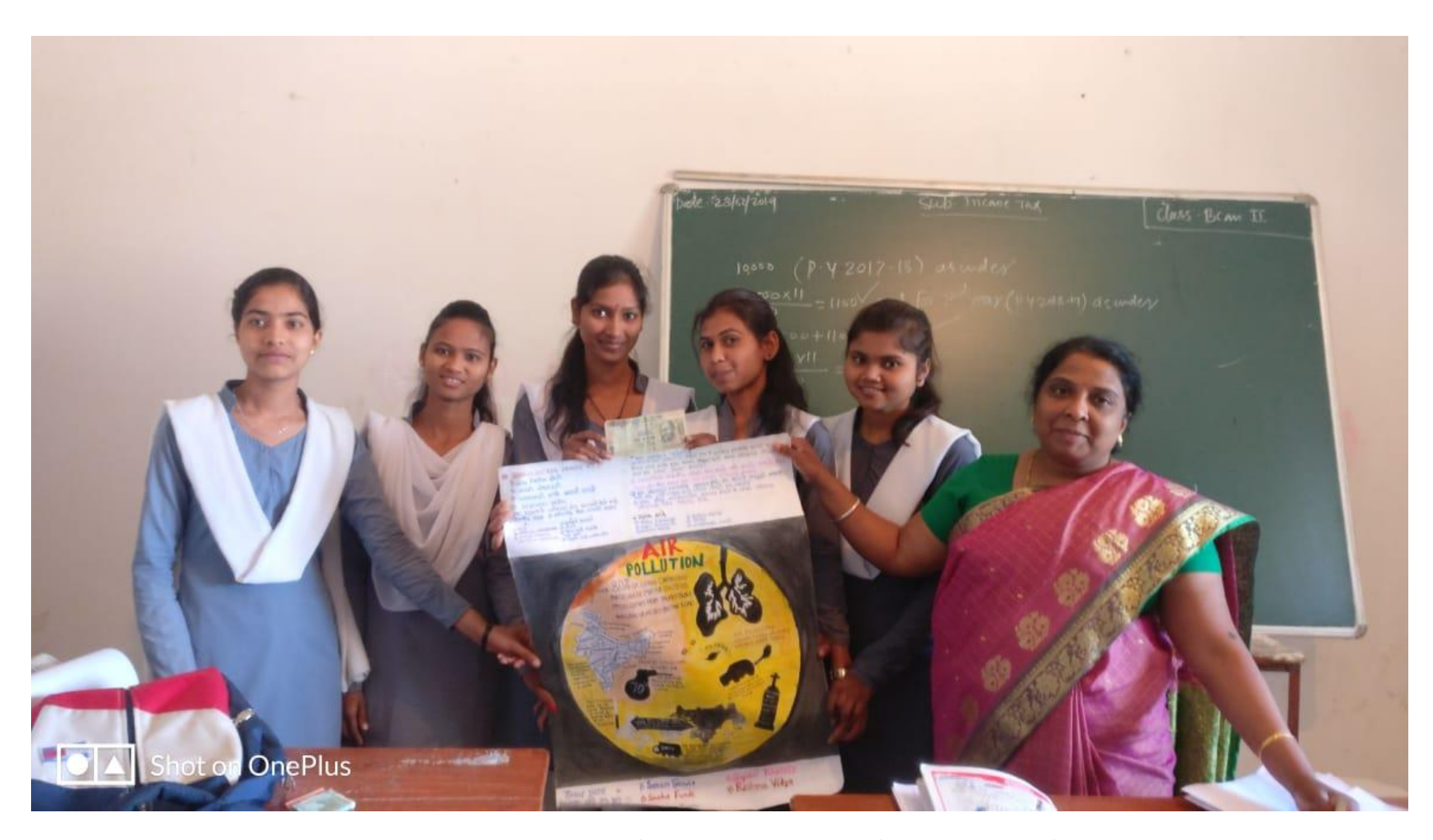
Best wallpaper being awarded with cash prize