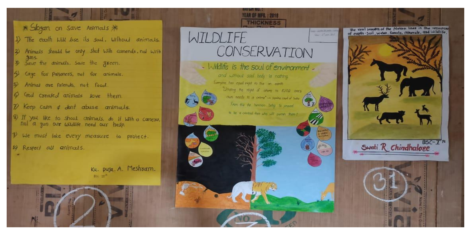
Wallpapers prepared by B. Sc. Students