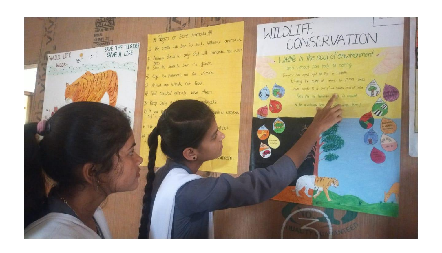
Students observing wallpapers