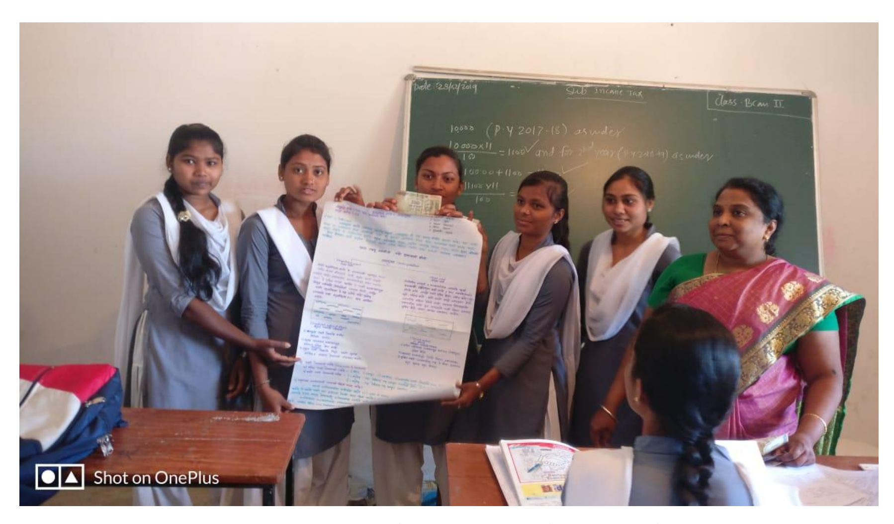
Best wallpaper being awarded with cash prize