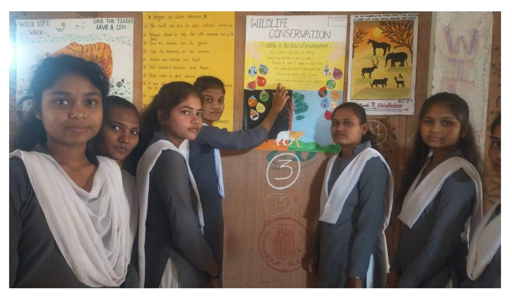
Students observing wallpapers