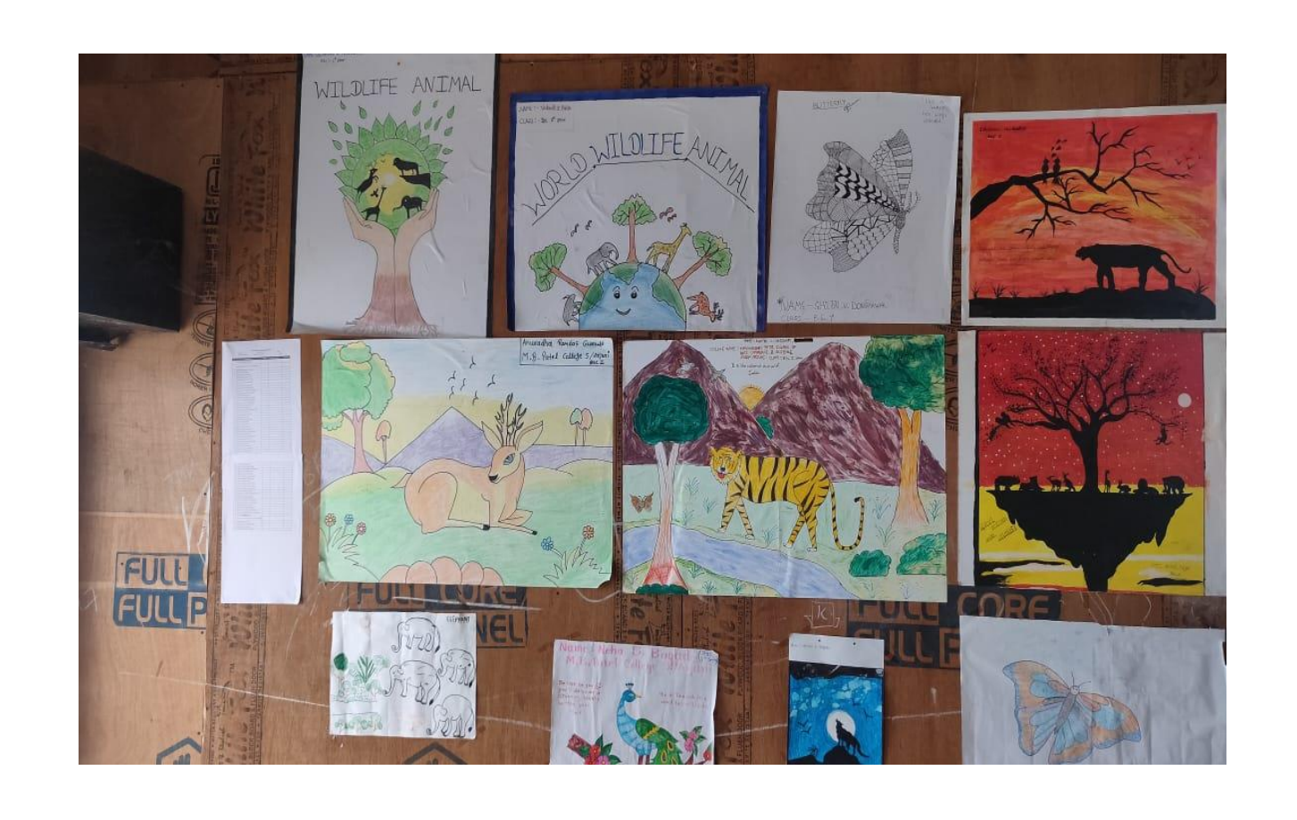
Wallpapers prepared by B. Sc. Students