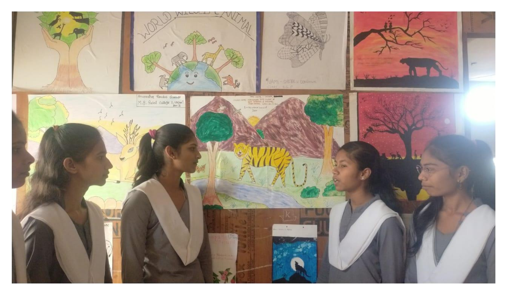
Student explaining wallpaper