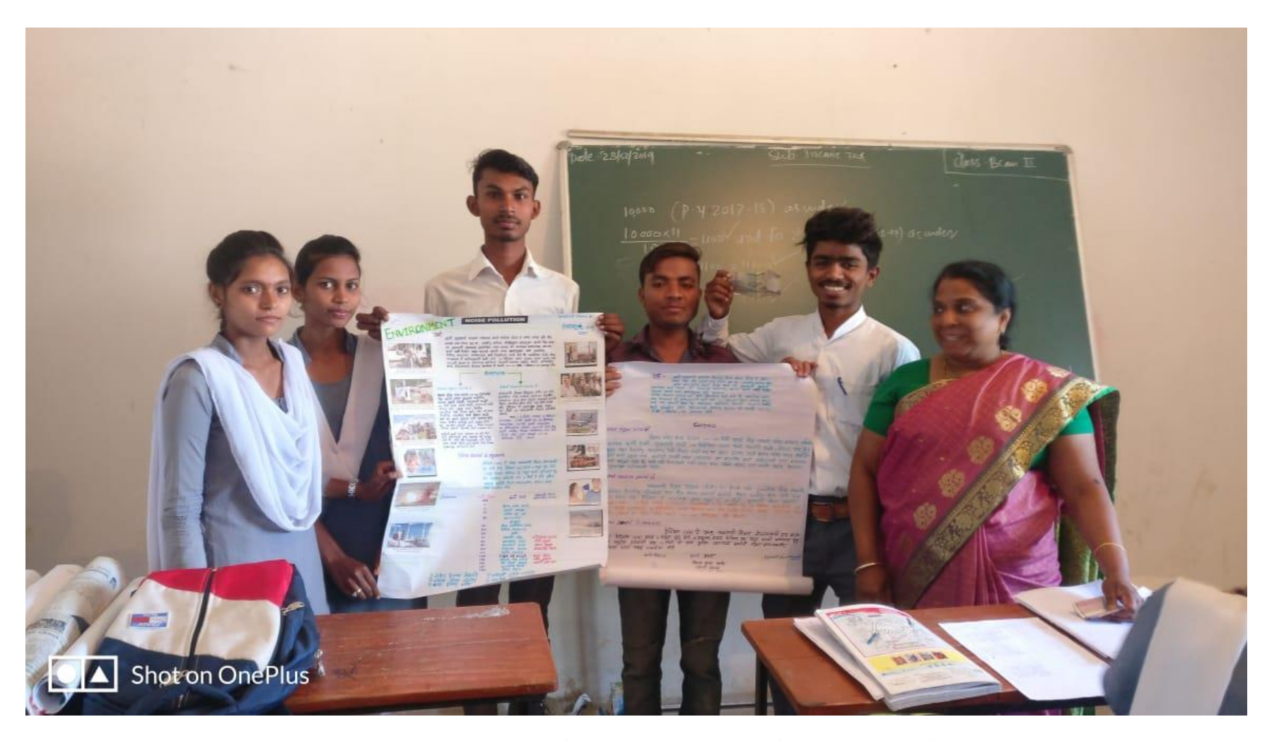
Best wallpaper being awarded with cash prize