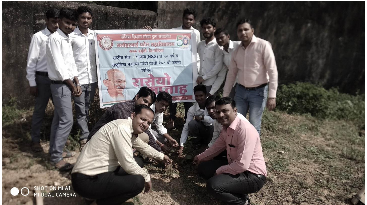
Tree plantation by college staff and students